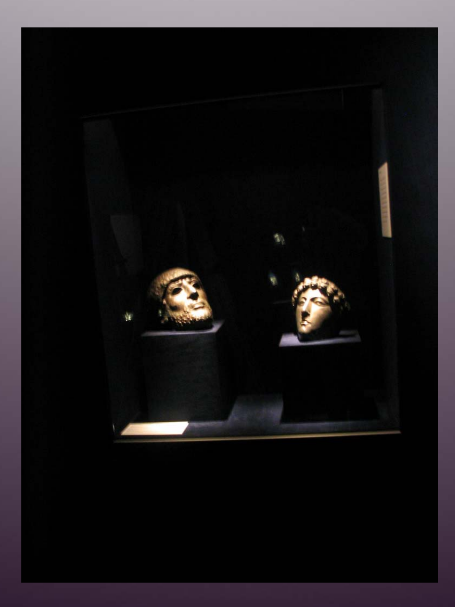
Past Roman culture, aesthetic perception Balkans exhibition, Adria 2008