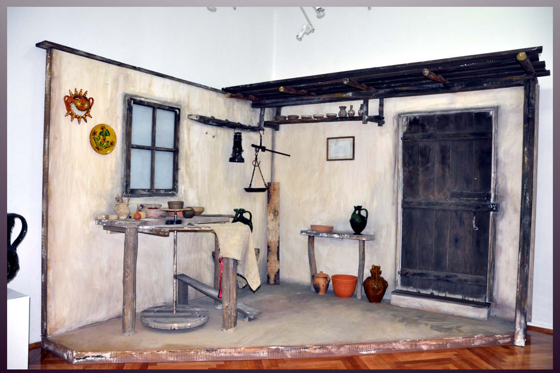
Reconstruction of potter's workshop at exhibition in National Museum Zajecar, 2011